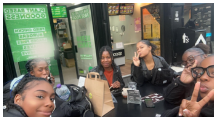
AJA's first over 18's link up, we went to lit and laive, organized by one of our other young girls.