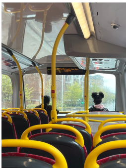
Two of our young girls on the way home from our trip to the garden museum during the April half term